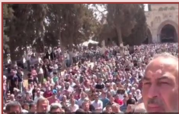
Palestine -The Blessed Land